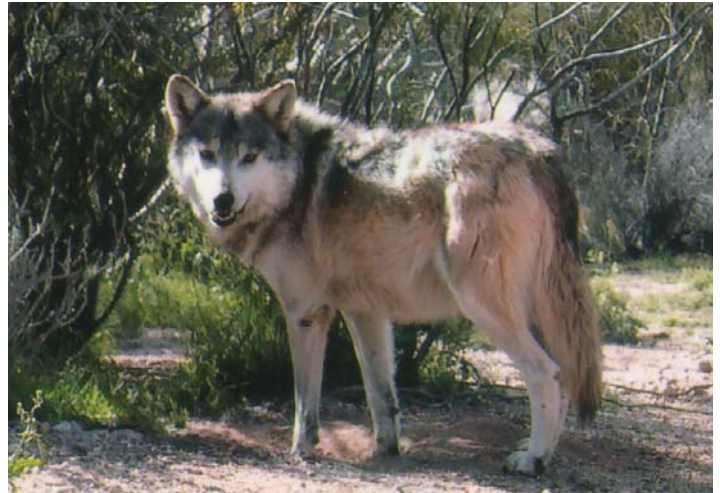
Wolf 435, also called "Chuska".